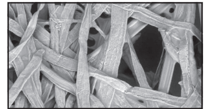
Economy Cellulose Cross Section 300X